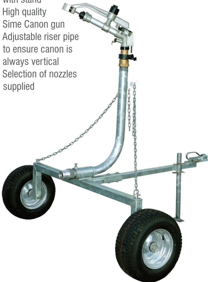
STATIONARY IRRIGATOR SPECIFICATIONS